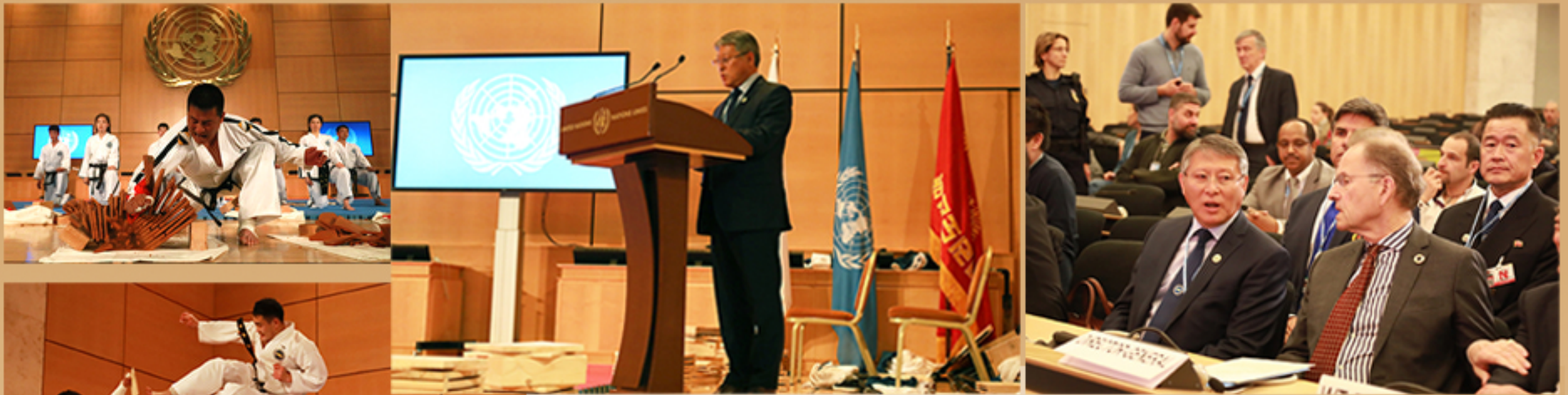
Taekwon-Do Demonstration in Geneva UN Office in Switzerland in 2019

To foster solidarity with Global Association of International Sports Federations (GAISF) and other international organizations and figures of politics, society, culture and sports