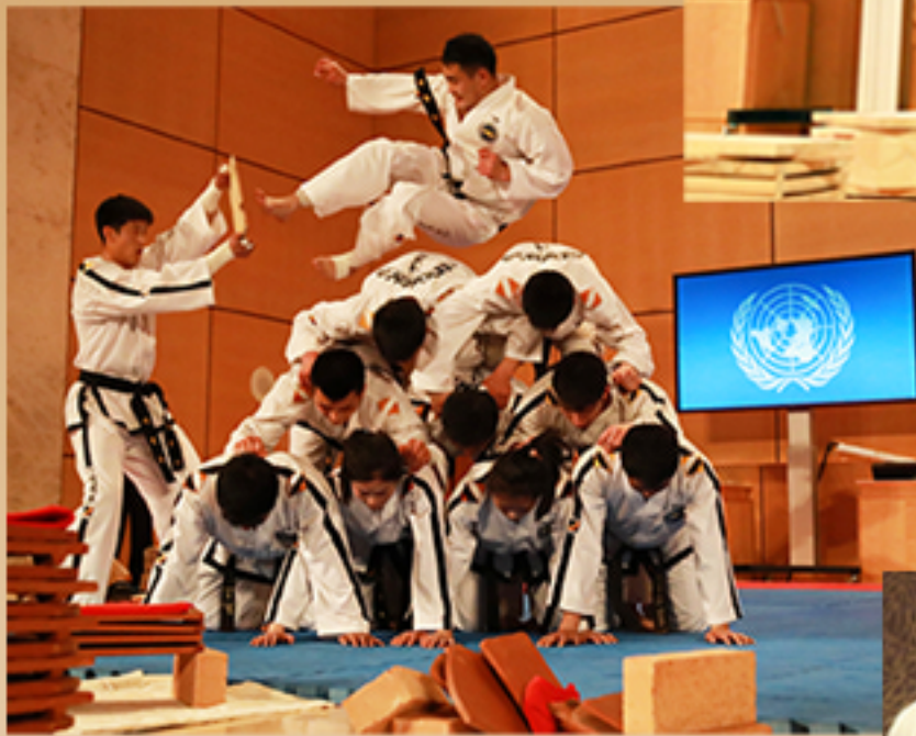
Taekwon-Do Demonstration in Vienna, Austria in 2019