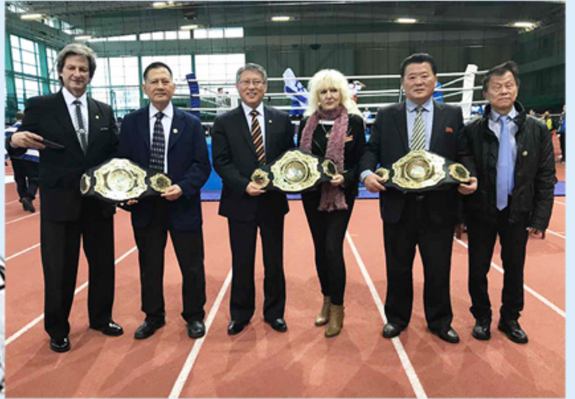
The 7th International Martial Art Games (29th Nov. - 4th Dec. 2017, Minsk, Belarus) 14 disciplines with 3 200 participants from 72 countries