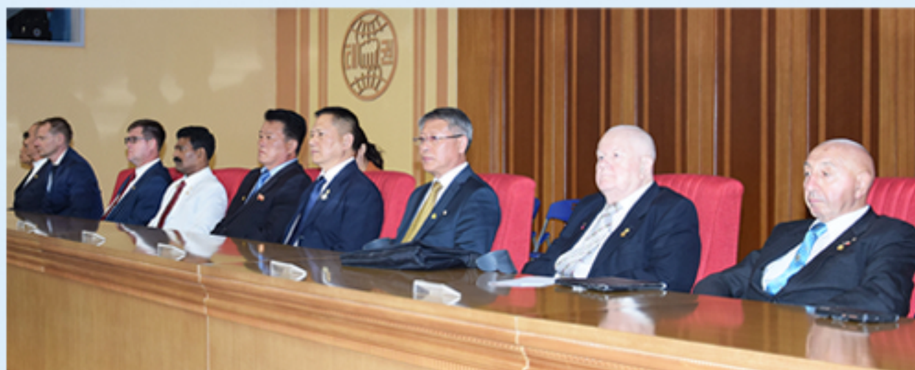
The celebration of the 20th Anniversary of Foundation of the IMGC (16th - 20th Sep. 2019, Pyongyang, DPR Korea)