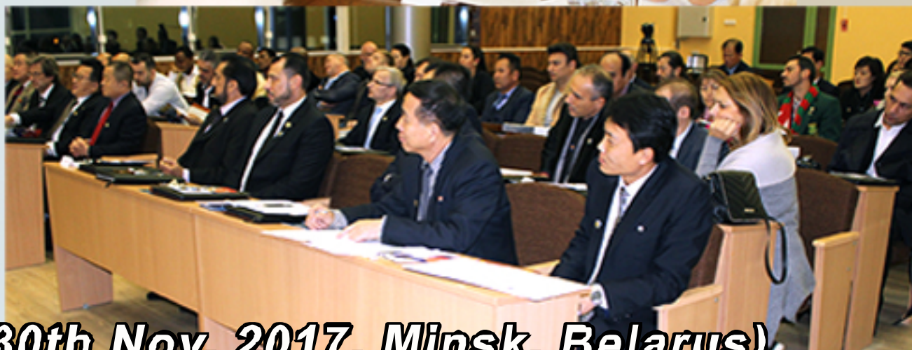
The 9th IMGC Congress (30th Nov. 2017, Minsk, Belarus)